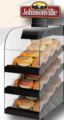
JVL-WC-787 Slim Cabinet Warmer Dimensions: 21.5"W x 9.5"H x 16.5"D Price: $349.00