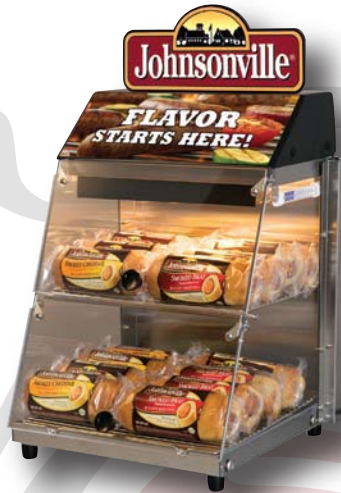
JVL-WC-727 Small Cabinet Warmer Dimensions: 13.25"W x 18.25"H x 12.25"D Price: $329.00