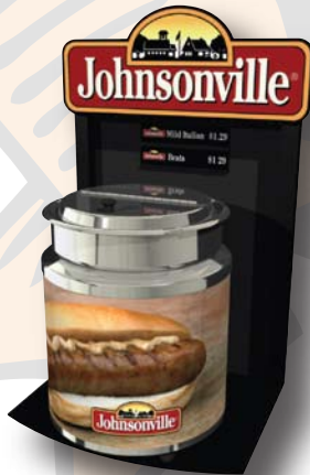
JVL-768-PKG Small Round Steamer Package Dimensions: 16.5"H x 24.5"D Price: $198.00 (Steamer alone JVL-768-STMR Price: $99.00)