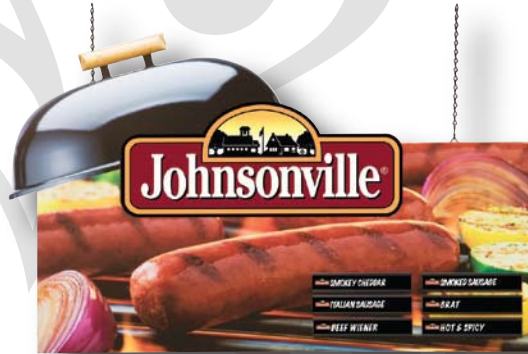
JVL-MER-HSE Hanging Sign Dimensions: 37.75"W x 23"H Price: $99.00 (Also available with stand JVL-MER-CT-S Price: $179.00)