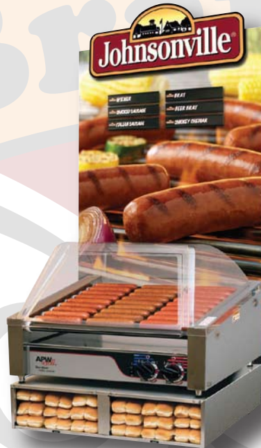
JVL-MER-CT-VS1 Vertical Countertop Sign Merchandiser (Rollergrill and Bun Box not included) Dimensions: 24"W x 42.25"H Price: $159.00 (Also available w/ Grill Lid JVL-MER-CT-VS2 Price: $179.00)